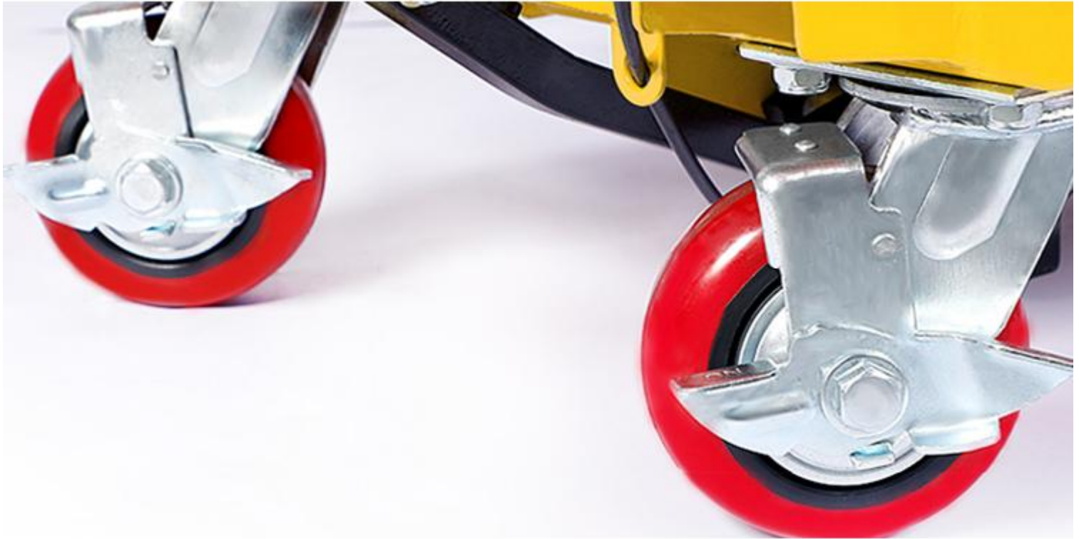
(4)split oil pump