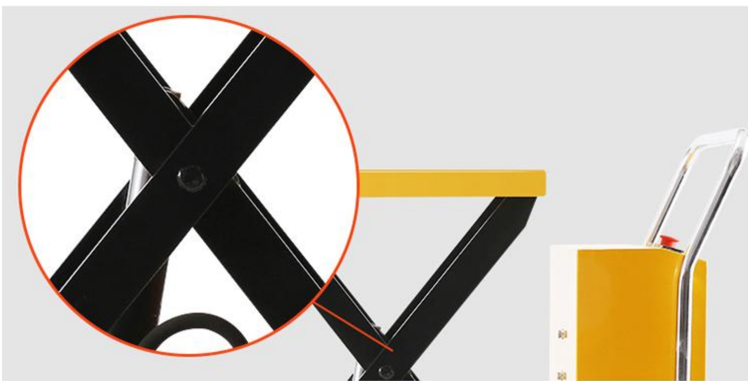
(2) PU wheels